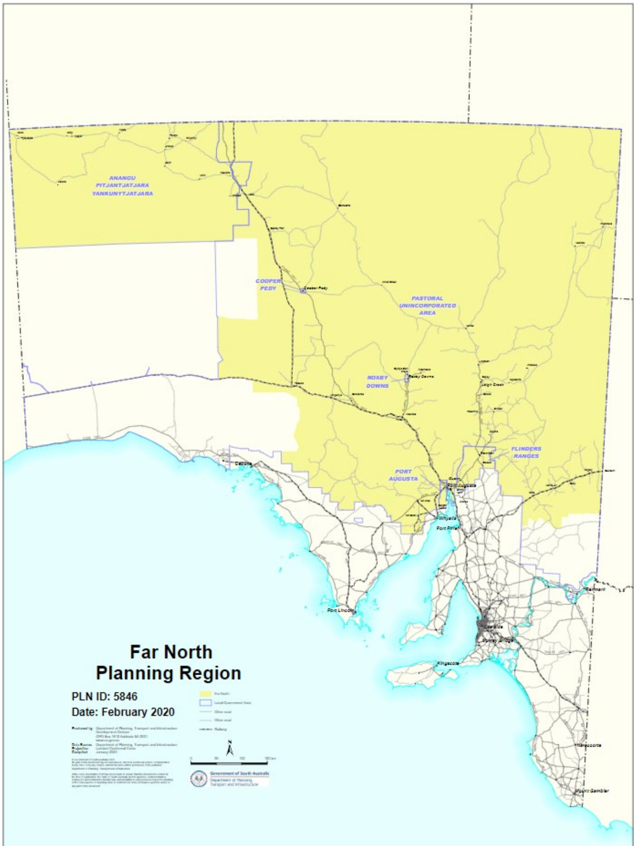
Figure 1. Far North Planning Region.