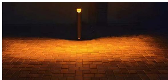
Example of a warm colour with low content short-wavelength bollard light

The proposed external lighting and control systems serving the Barossa Hotel development shall be based on the above technical content of this memorandum to ensure compliance with the legislative requirements for safe movement while minimising obtrusive lighting to neighbours and the potential effect on native wildlife.