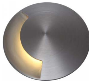
Example of a low output ground light

The following are intended to provide a visual representation of the types of lighting solutions that will be employed to address the concerns relating to native wildlife raised above: