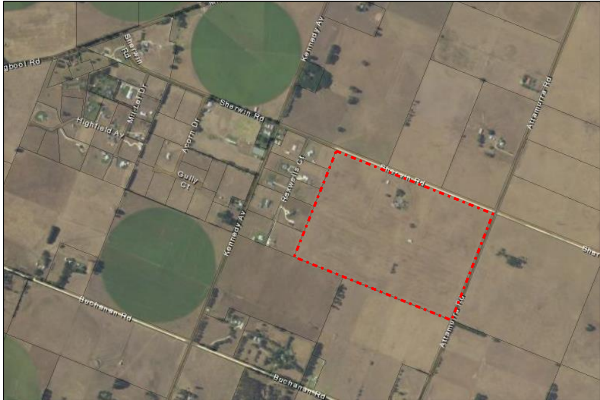
Figure 1 – Affected Area