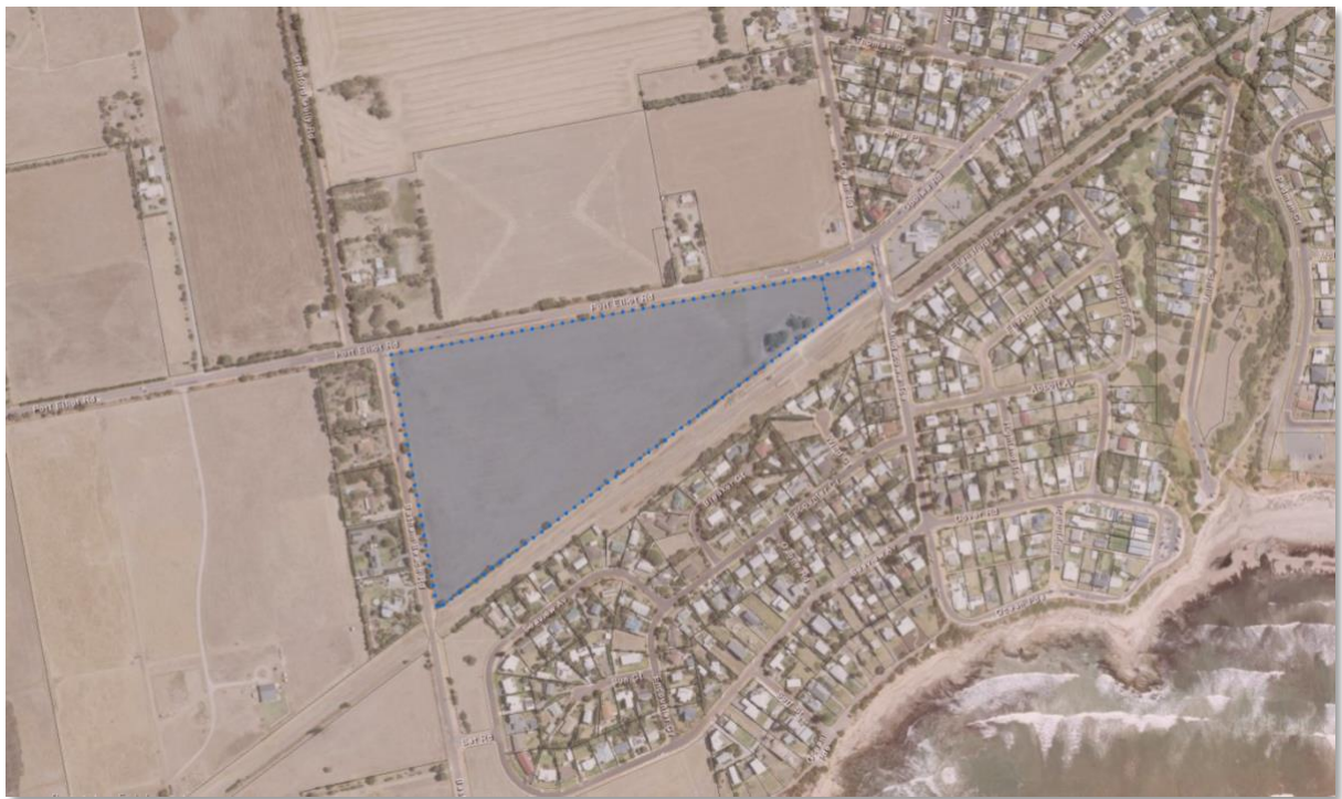
Existing : Airport Building Heights (Aircraft Landing Area) Overlay