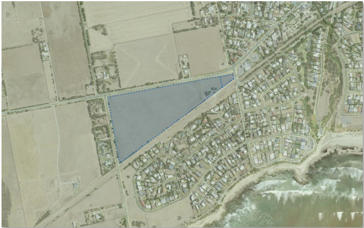
Existing: Native Vegetation Overlay