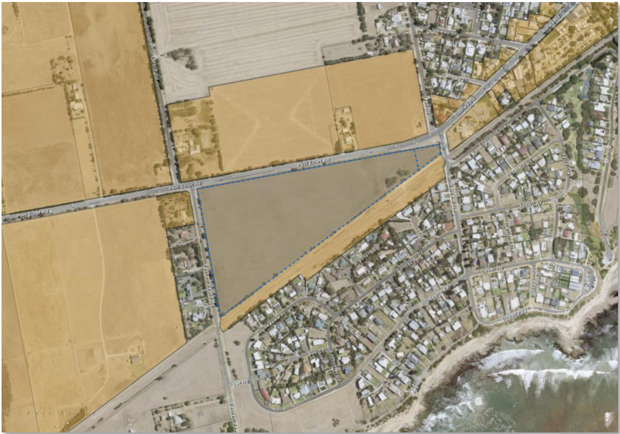
Existing: Urban Transport Routes Overlay