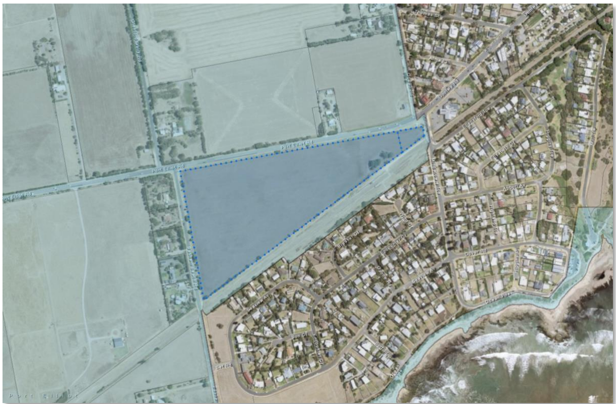
Existing: Hazard (Bushfire – Medium) Overlay