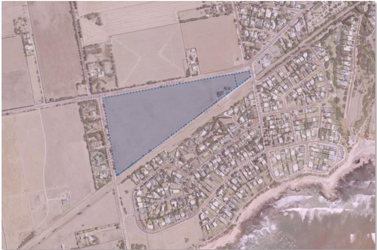
Existing: Airports Building Heights Overlay