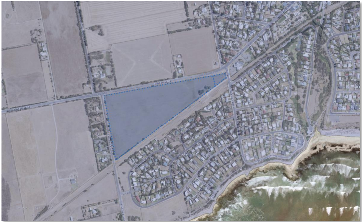
Existing: Hazard (Flooding – Evidence Required) Overlay