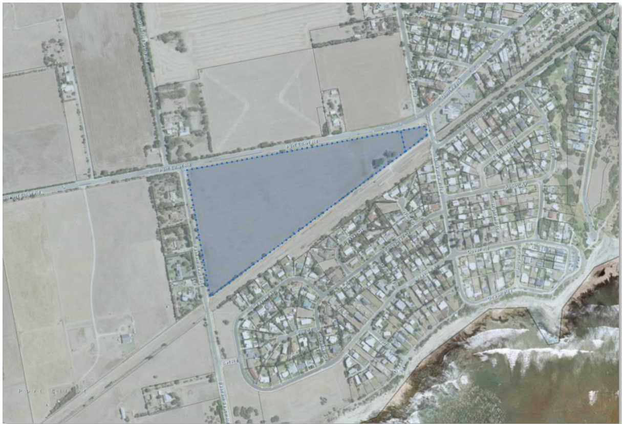
Existing: Murray Darling Basin Overlay