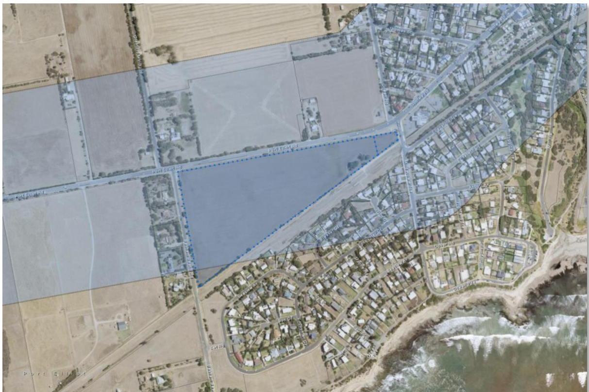
Existing: Traffic Generating Development Overlay