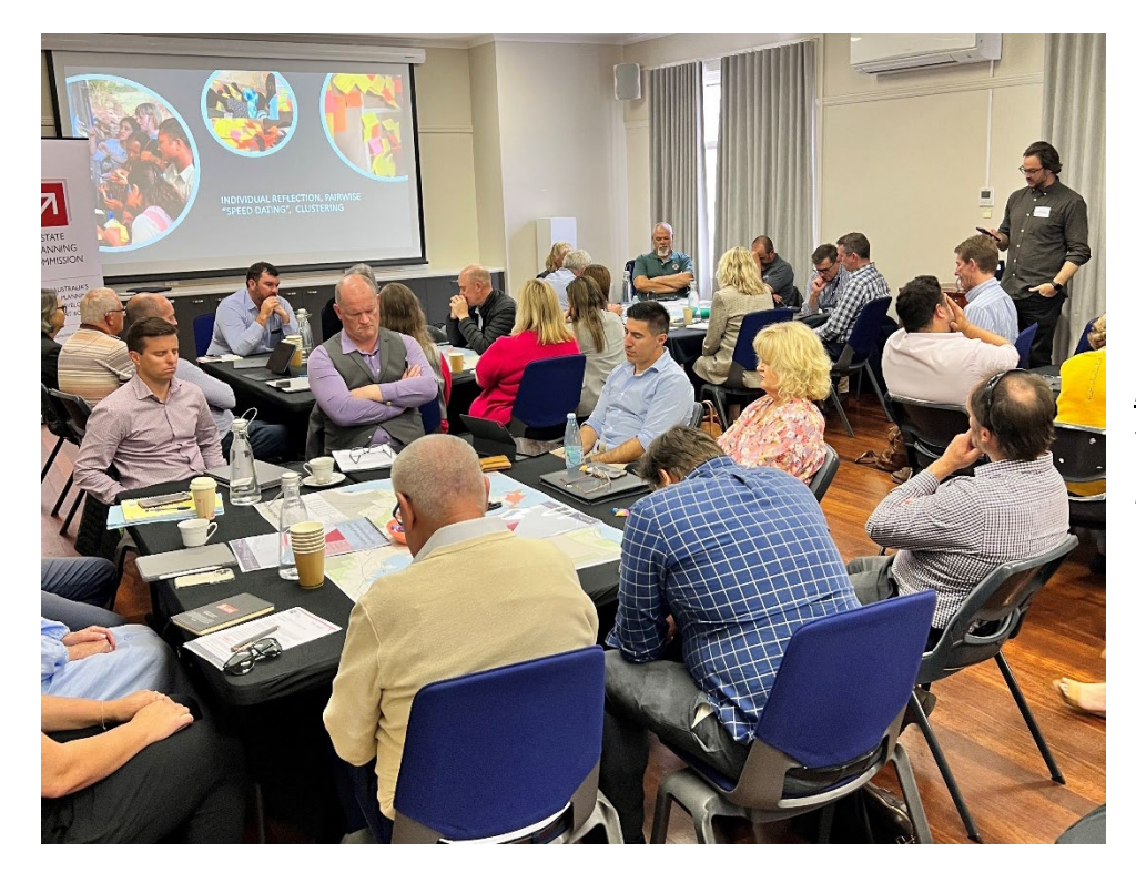
<u>Figure 2</u>: Key stakeholders engaged in a visioning exercise in Port Lincoln on 27 March.