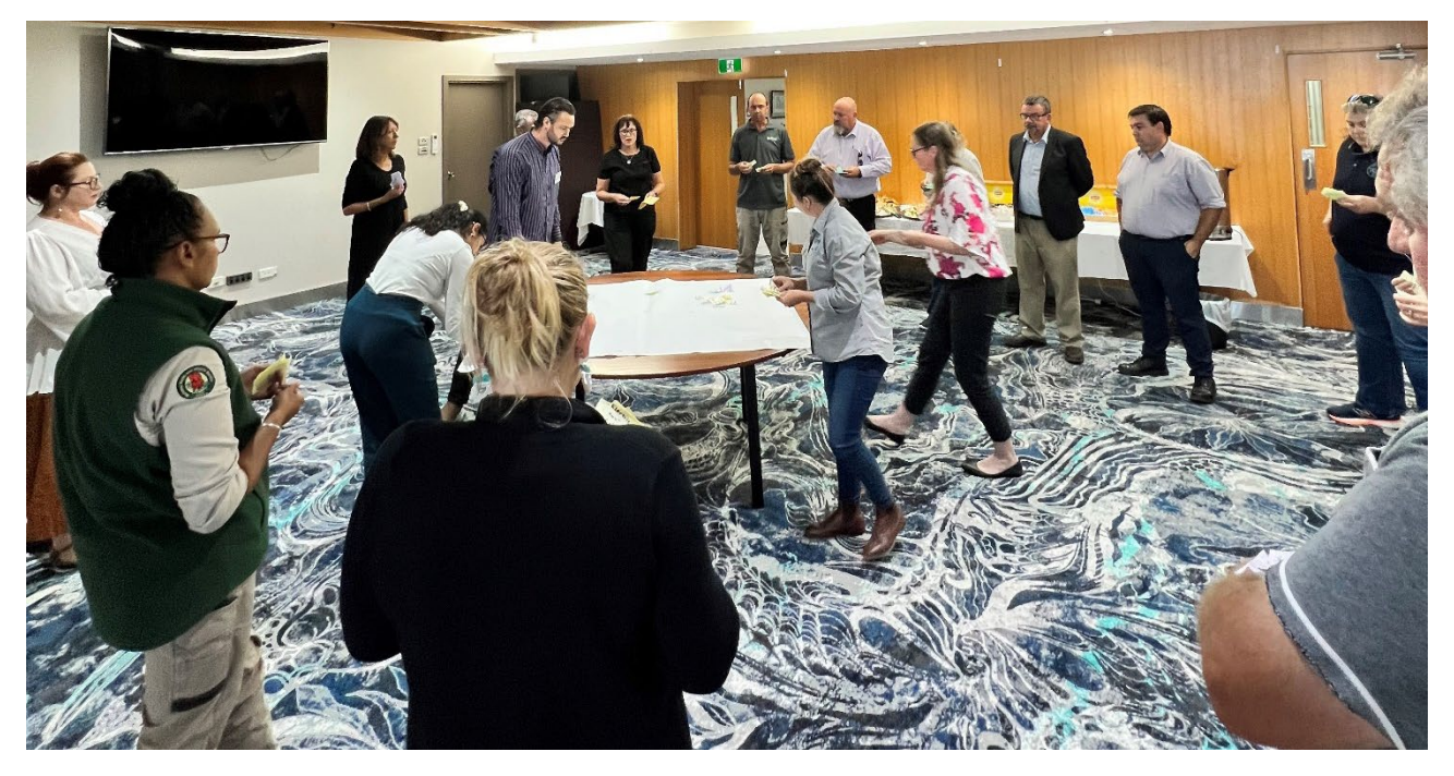
Figure 2: Eyre and Western Visioning Workshop held in Ceduna on 29 March 2023

saplanningcommission.sa.gov.au PlanSA@sa.gov.au PlanSA Service Desk 1800 752 664