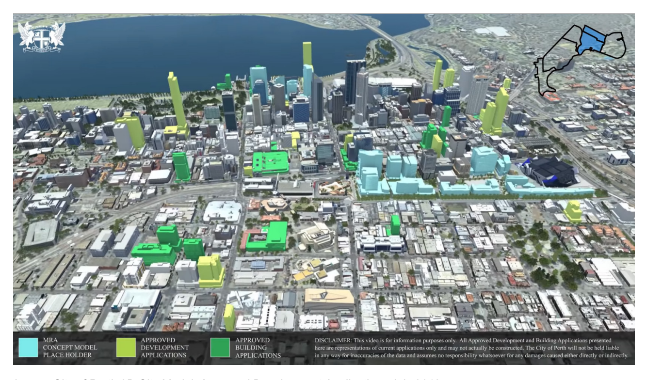
Image: City of Perth 3D City Model, Approved Development Applications July 2018.

3D models are computer-generated engagement tools that use geospatial data to visualise changes to built form or land use. They are being used by a growing number of councils around Australia as a way of engaging with their communities in a discussion about growth, future form and function.