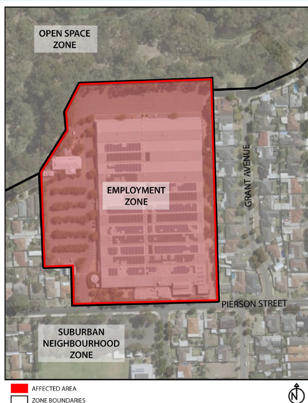
Figure 1: Affected Area and current zone boundaries