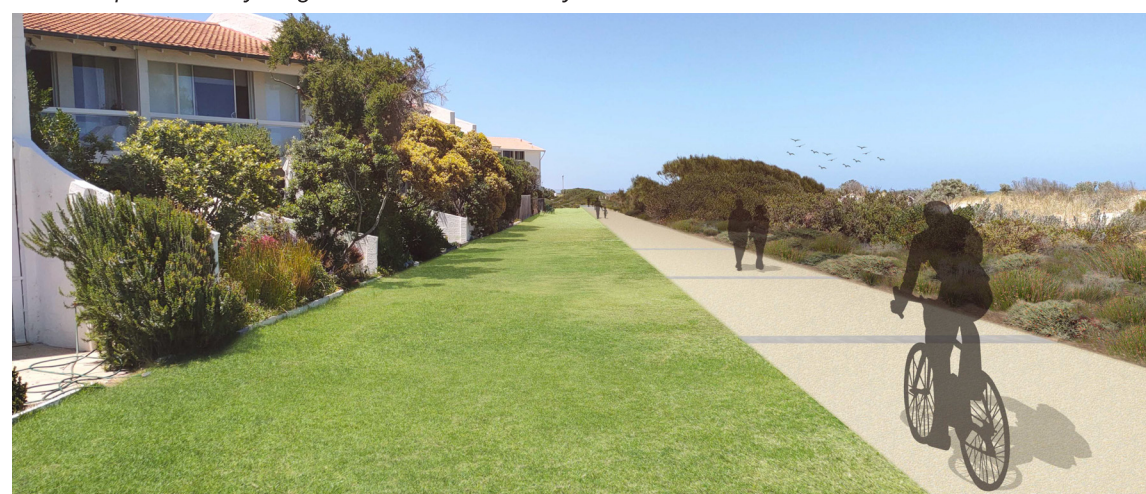
View 2: Visualisation south of Mirani Court (West Lakes Shore) looking north Artistic impression only. Vegetation shown at maturity.