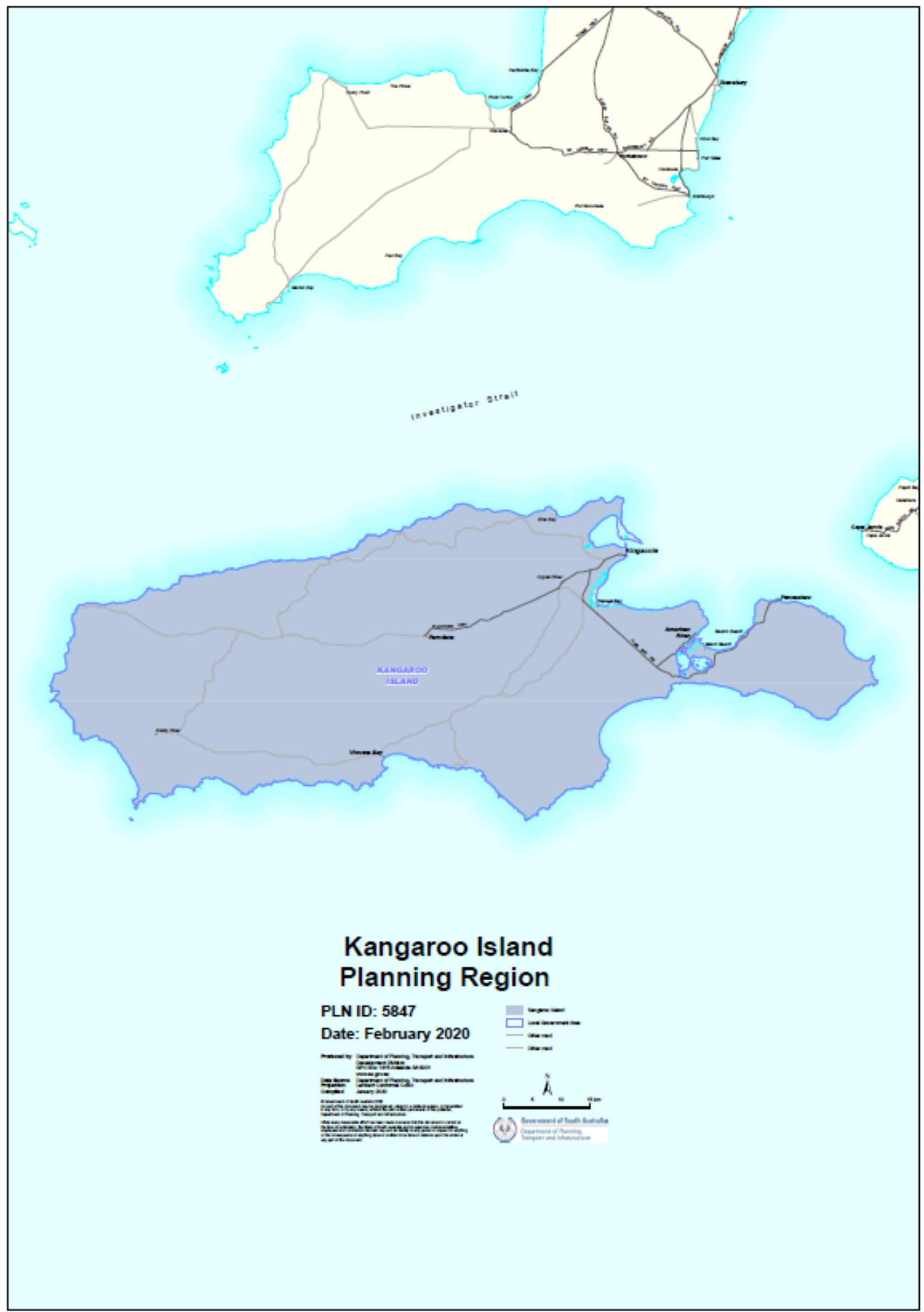
Map of Affected Area – Kangaroo Island Region