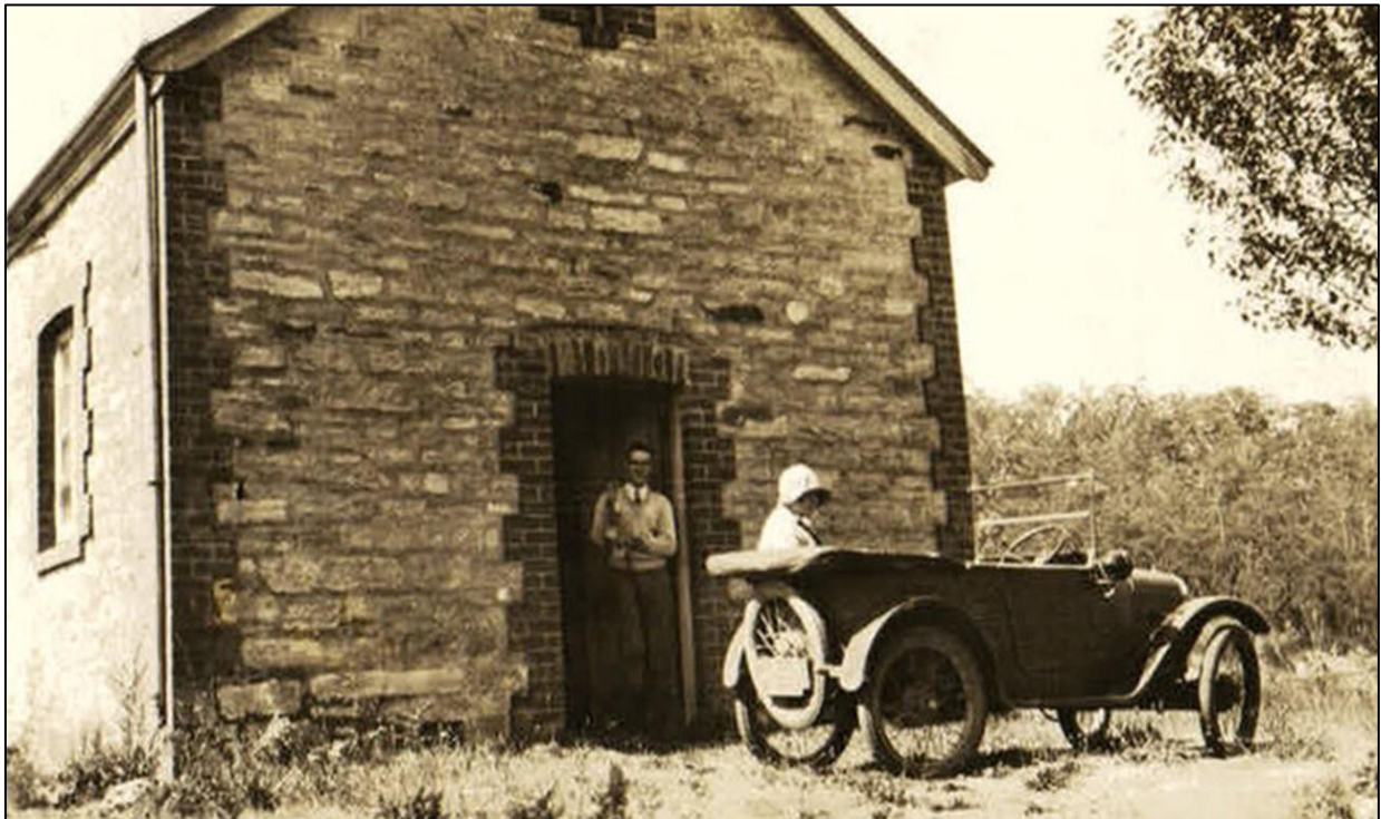
Figure 2. Scent Factory Historic Photo, date unknown.