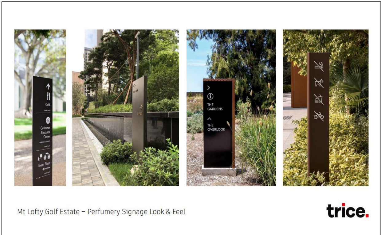
Figure 1. Examples of signage proposed for the Perfumery (Trice 2023).