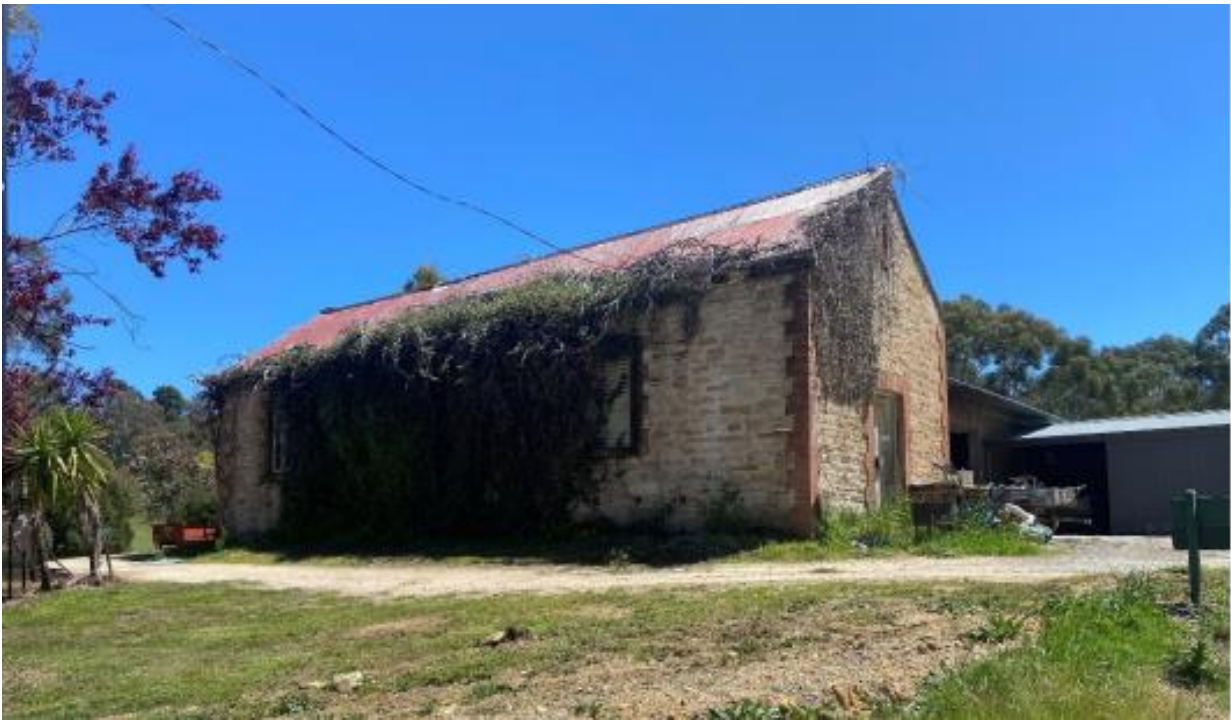
Figure 4. Scent Factory in 2020.