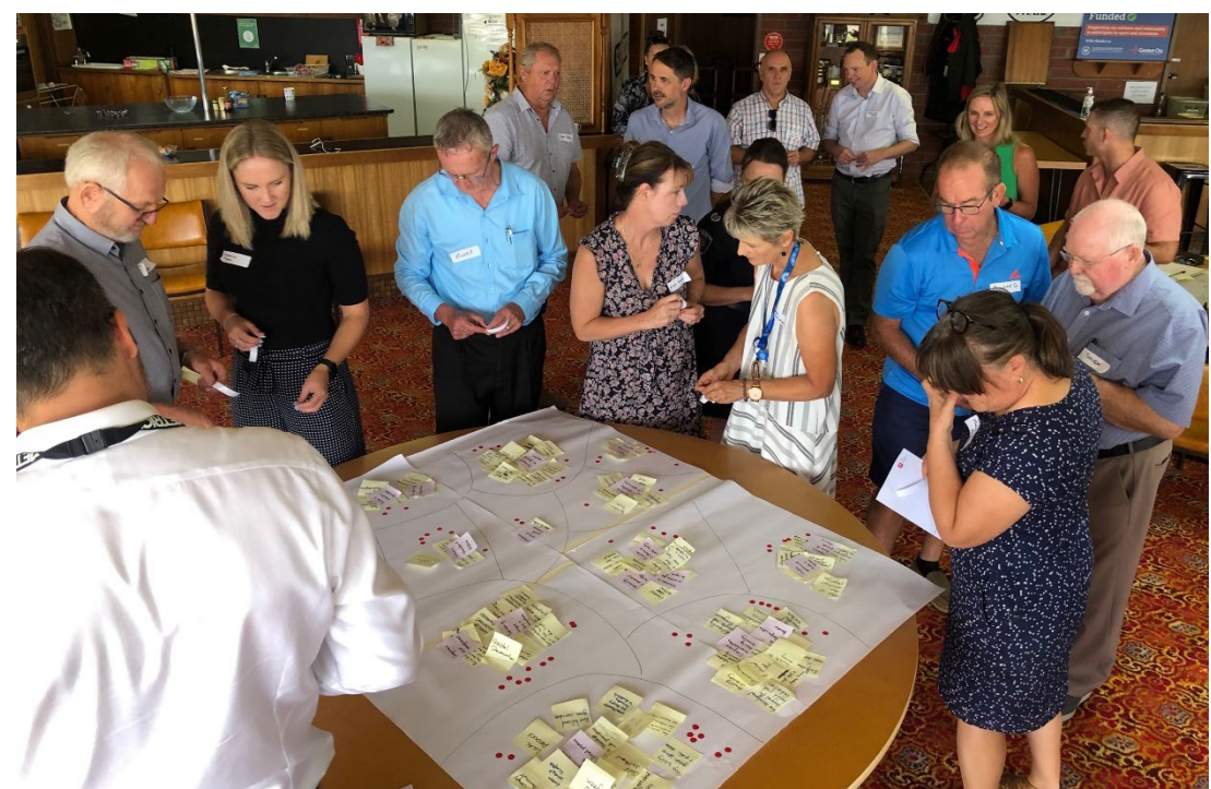
Figure 2: Yorke Peninsula and Mid North Visioning Workshop held at the Maitland Golf Club on 24 February 2023