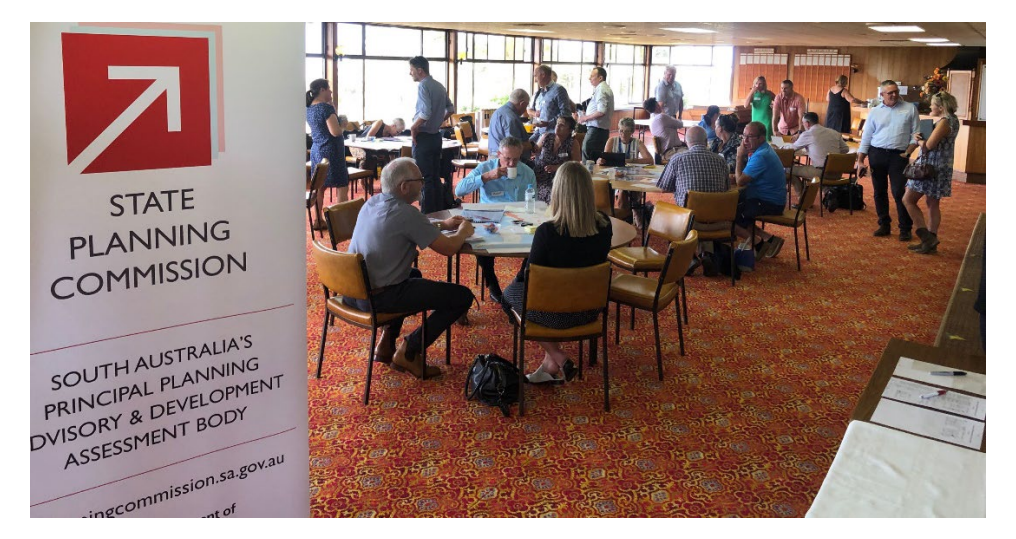
Figure 1: Key stakeholders engaged in the Maitland Visioning Workshop held on 24 February 2023.

To date pre-workshop engagement activities, designed to inform councils, state agencies and key industry representatives, have been conducted by the Department. The Yorke Peninsula & Mid North Visioning Workshops were held on the 23<sup>rd</sup> (Clare) and 24<sup>th</sup> of February (Maitland), where representatives from the local councils, key industry organisations, departments and progress associations were present. The workshops were led by the State Planning Commission, Planning and Land Use Services and Department of Premier & Cabinet. 54 key stakeholders were in attendance and provided invaluable knowledge of the Yorke Peninsula & Mid North region, by exploring how the various communities will be shaped, live, and grow over the next 30 years. The information collected during the Visioning Workshops will play a critical role in shaping the Yorke Peninsula & Mid North Regional Plan.