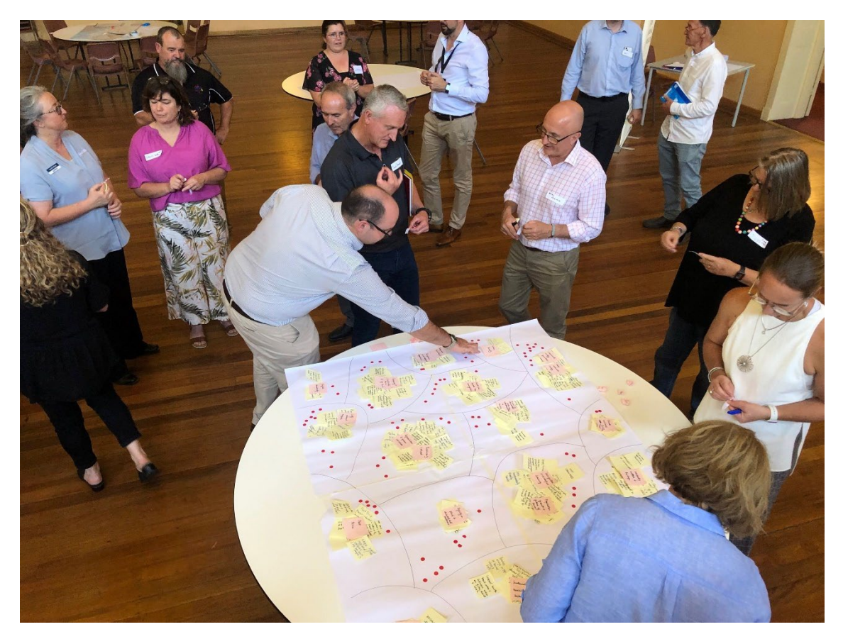
Figure 2: Yorke Peninsula and Mid North Visioning Workshop held at the Clare Town Hall on 23 February 2023

• Increased use of renewable energy on farms and increased intensive agriculture industries and secondary processing plants with Gulf waters protected for sustainable harvest in small sections.