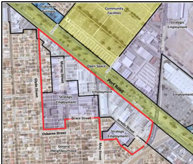
Figure 1: Affected Area

The Code Amendment proposes rezoning the majority of the Affected Area from its current Employment and Strategic Employment Zones to zones that will facilitate mixed use development in the form of higher density residential and/or commercial development.