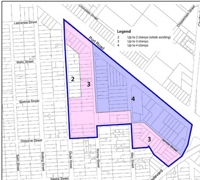
Figure 3: Proposed Building Heights