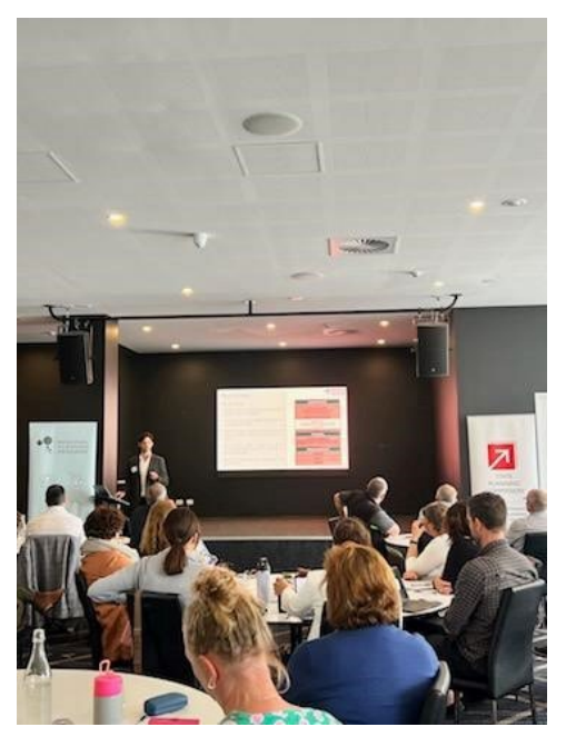
Figure 3 & 4: Key stakeholders engaged in the Murray Bridge Visioning Workshop held on 31 October 2024.