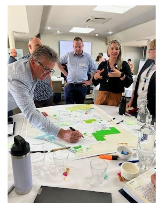
Figure 1 & 2: Key stakeholders engaged in the Berri Visioning Workshop held on 21 October 2024.