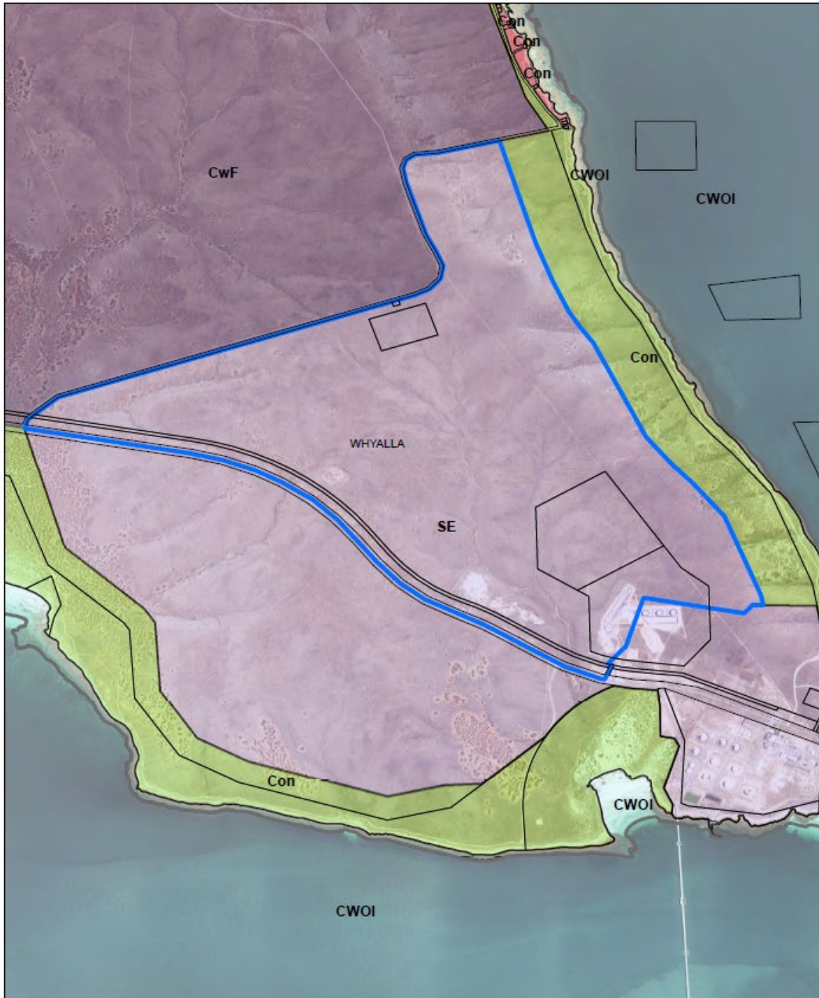
City of Whyalla, Port Bonython Proposed Zones