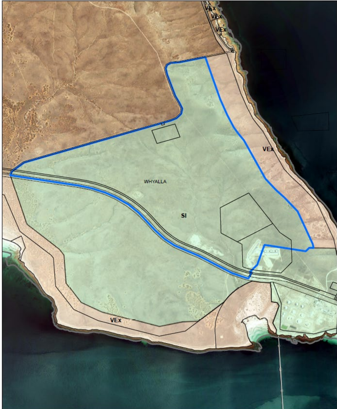
City of Whyalla, Port Bonython Proposed Subzones