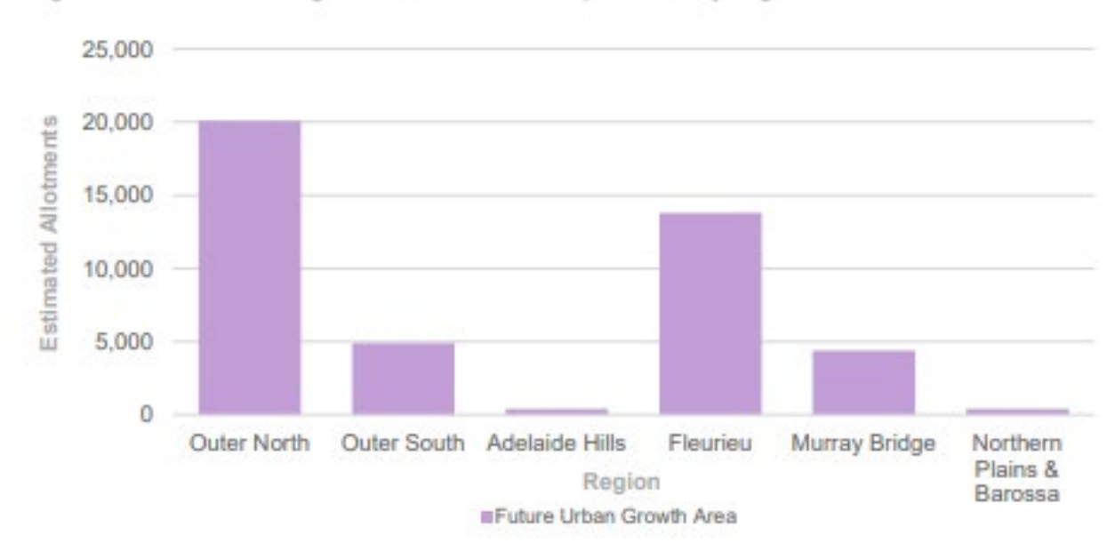
Figure 2: Future Urban growth area allotment potential by region