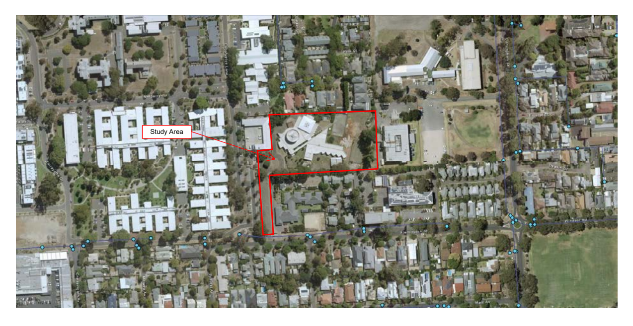
Figure 2 - Stormwater Network

From the Locations SA Viewer, it can be seen that there is an existing 375 mm stormwater pipe within Flemington Street. This pipe originates in Flemington Street, to the east of the proposed re-zoned land. It drains towards and through the Glenside site, where it discharges into a detention basin that forms part of the larger Brownhill Keswick Creek catchment. Refer Figure 2 for a plan showing the stormwater infrastructure around the site.